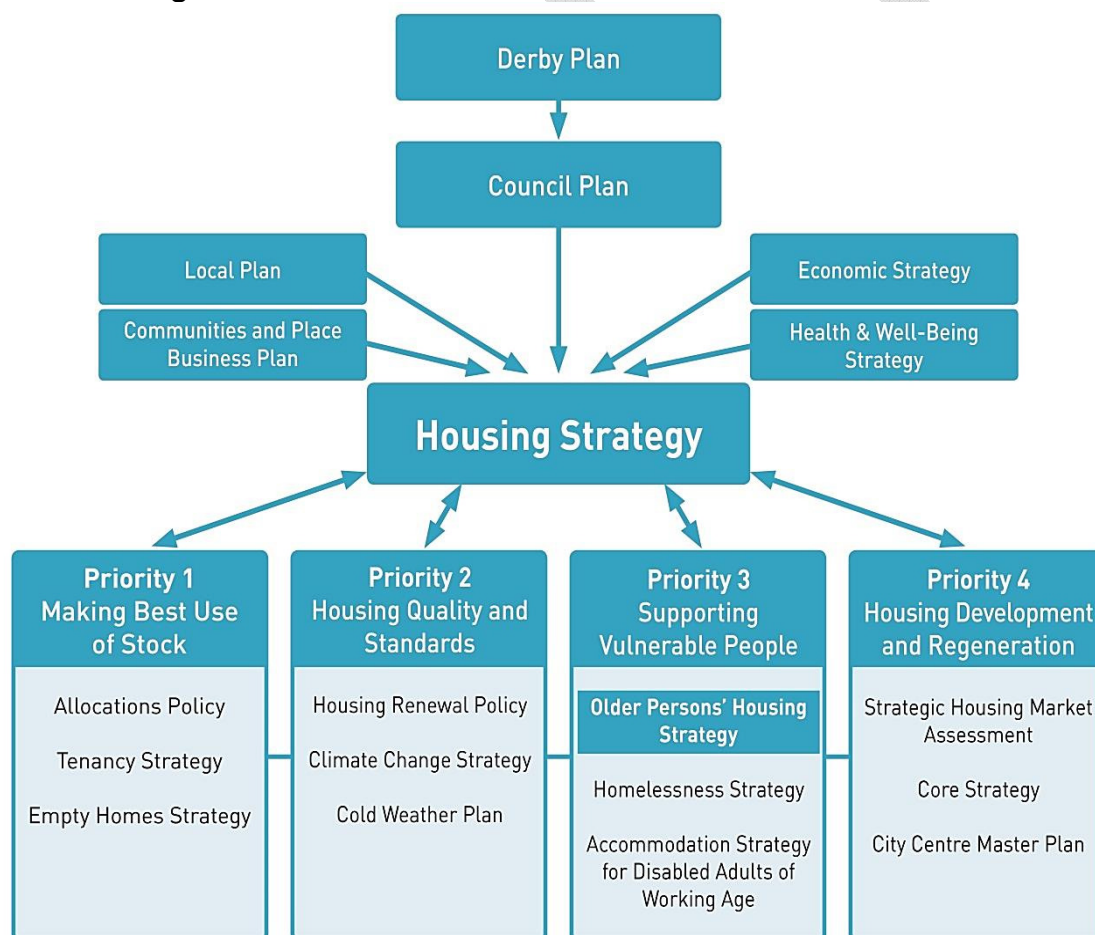
Figure 1: Strategic Links